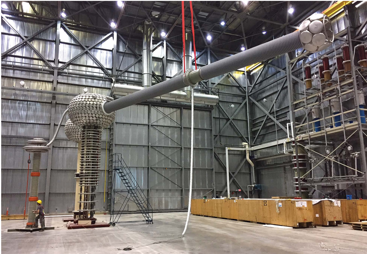
DC polarity reversal test with PD on 500 kV wall bushing.