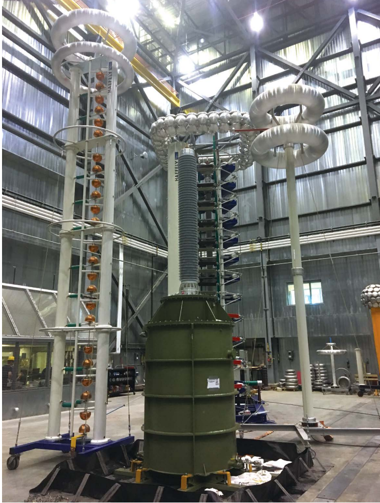
Lightning impulse withstand test on a 230 kV AC transformer bushing.